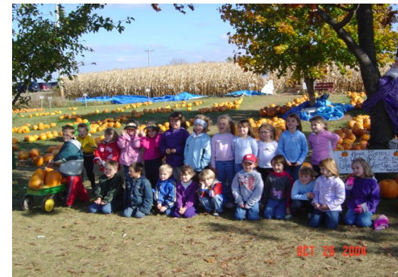
Kindergarten visits the Pumpkin Farm